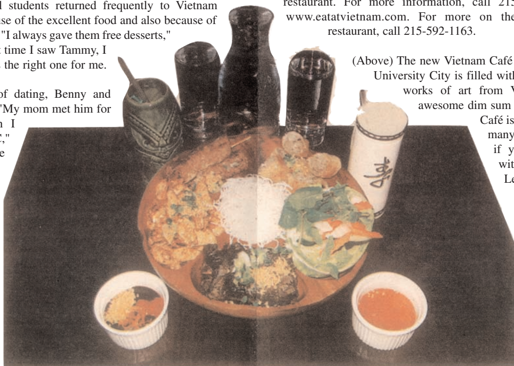
(Above) The new Vietnam Café at 816 S. 47th St. in University City is filled with authentic, beautiful works of art from Vietnam. (Left) The awesome dim sum appetizer at Vietnam Café is a great way to sample many Vietnamese dishes if you are not familiar with them

There is a big, free municipal parking lot right in back of the restaurant. For more information, call 215-729-0260 or visit www.eatatvietnam.com . For more on the original Vietnam restaurant, call 215-592-1163.